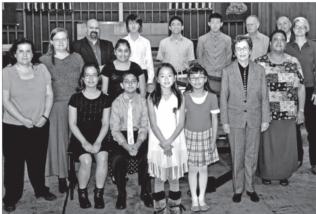
Students, Board Members and Volunteers at the Dress Rehearsal in November 2013.

Saturday, Dec. 6, 2014 Reception to follow.